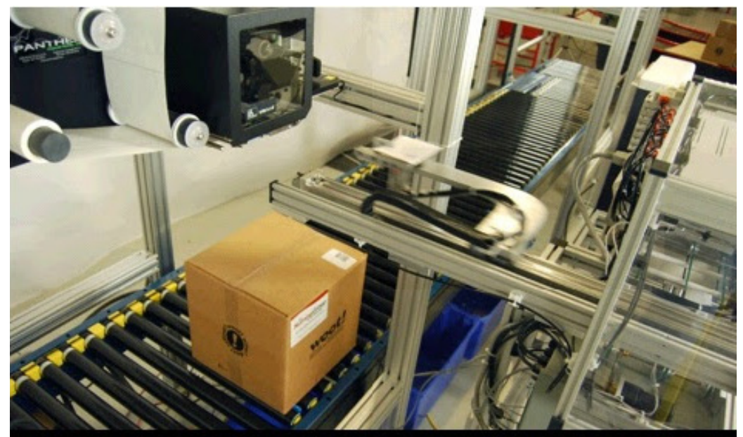
Full size packing sheet is automatically printed, "folded & tucked" under the removable shipping label as shown below.

Auto applies a full 8.5"x 11" packing sheet and shipping label